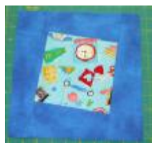
Finished block with edges removed.